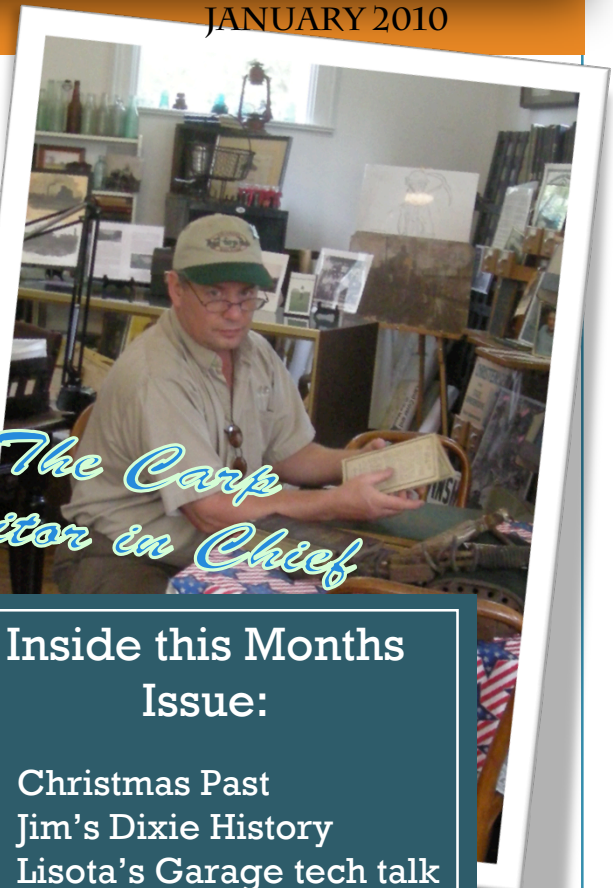
The Carp Editor in Chief