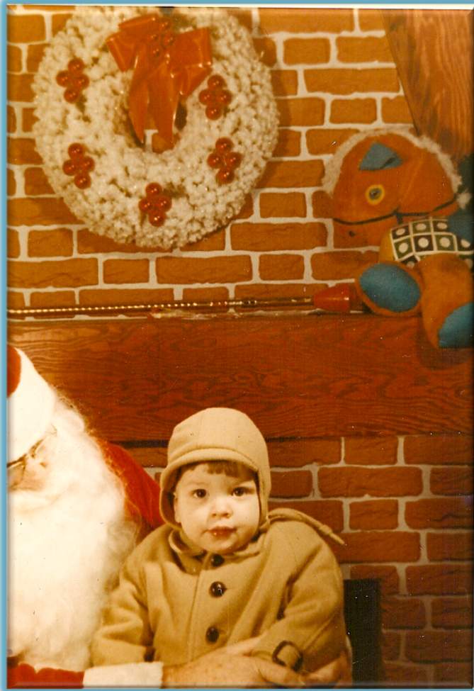
He still looks the same today!