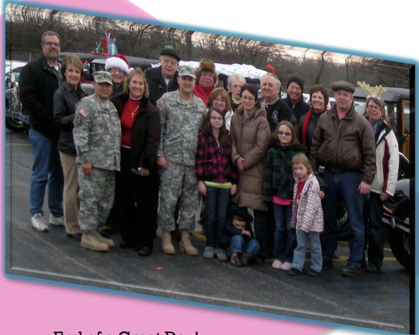
End of a Great Day!