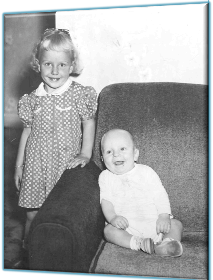
Both of these kids are members.