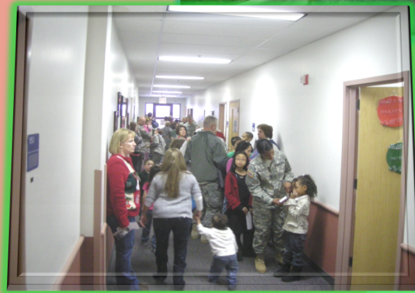
Line for Santa